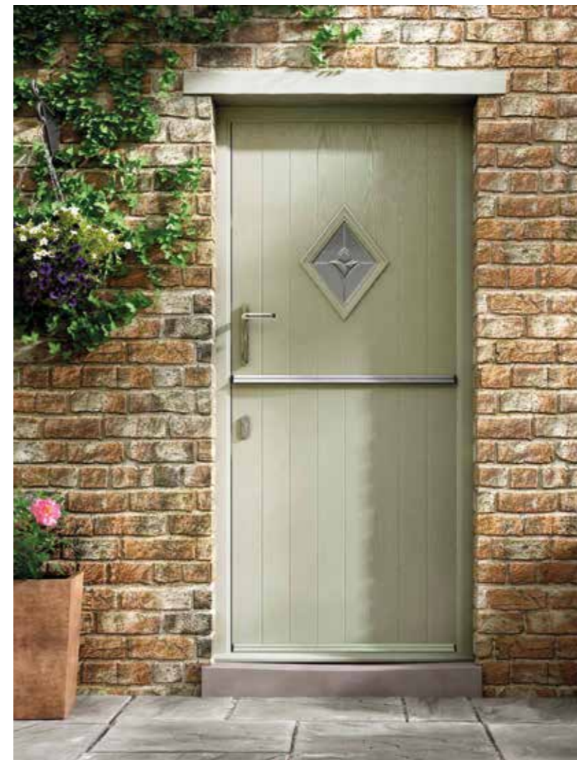
Image shown is a composite stable door. For more details please refer to our Magnum Composite Door brochure.